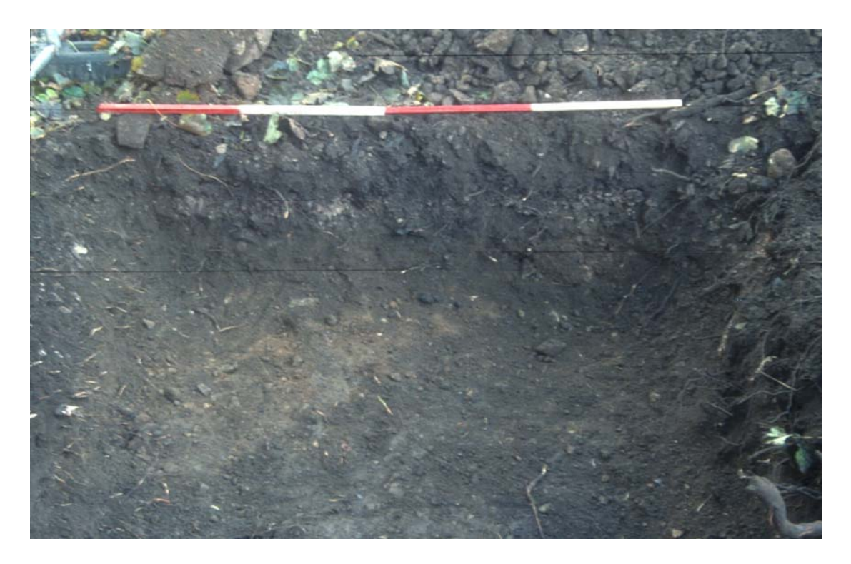
Plate 1: North-east-facing section of Test Pit 2