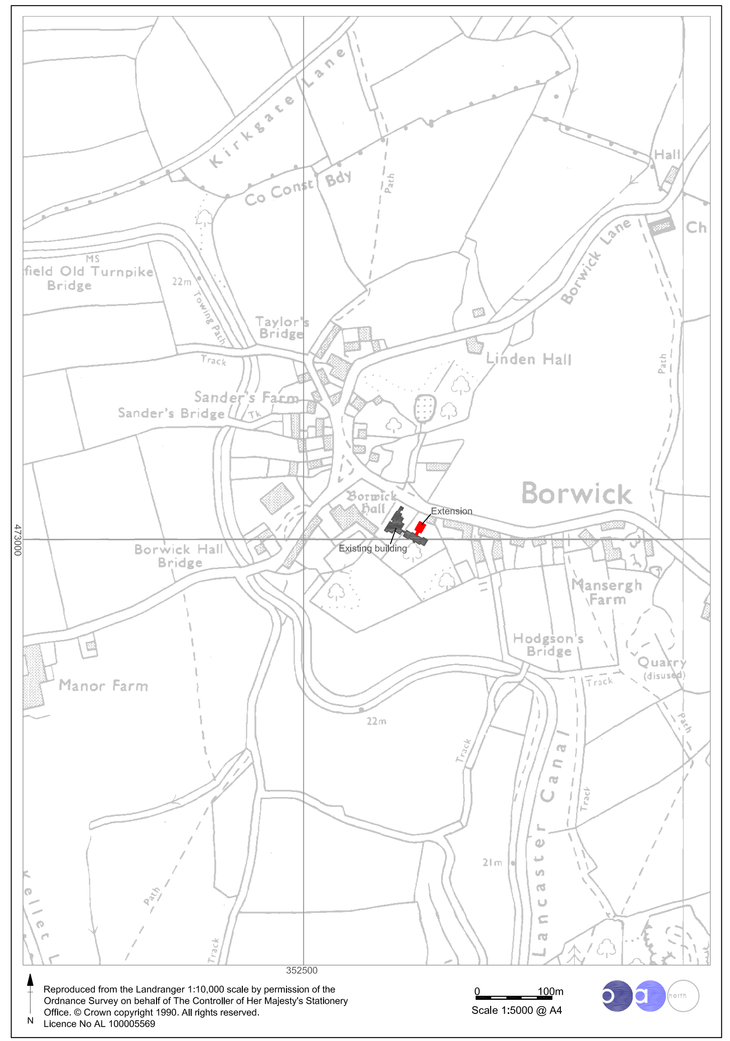
Figure 2: Site location plan