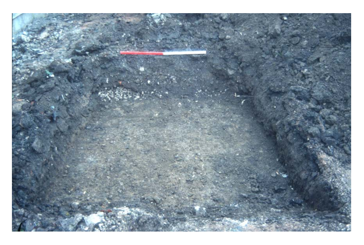
Plate 2: North-east-facing section of Test Pit 3