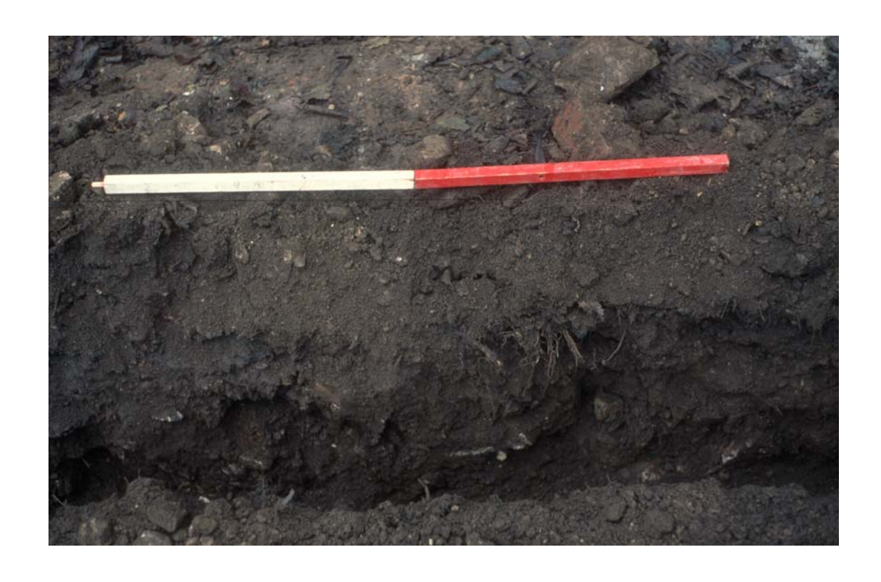
Plate 4: North-east-facing section of Service Trench 3