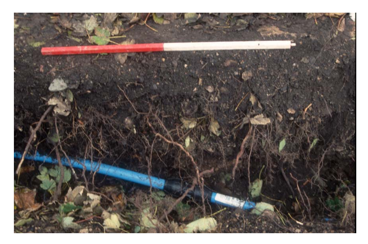
Plate 3: South-west-facing section of Service Trench 2